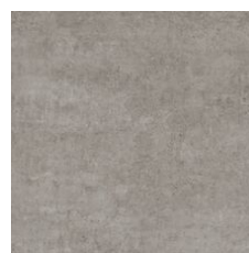
Base 77504 V2 - Slight Variation