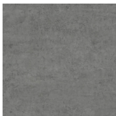
Elevate 77518 V2 - Slight Variation