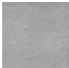
Threshold 77515 V2 - Slight Variation