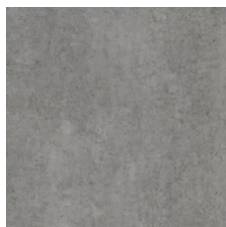
Chisel 77520 V2 - Slight Variation