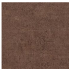
Terra Cotta 77715 V2 - Slight Variation