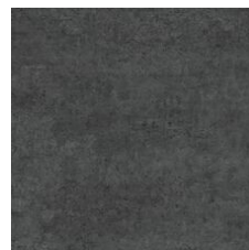
Granite 77585 V2 - Slight Variation