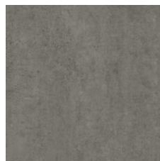
Foundation 77530 V2 - Slight Variation