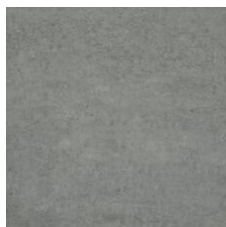
Onset 77525 V2 - Slight Variation