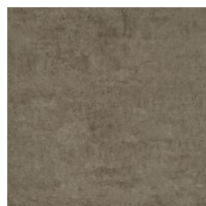
Bisque 77620 V2 - Slight Variation